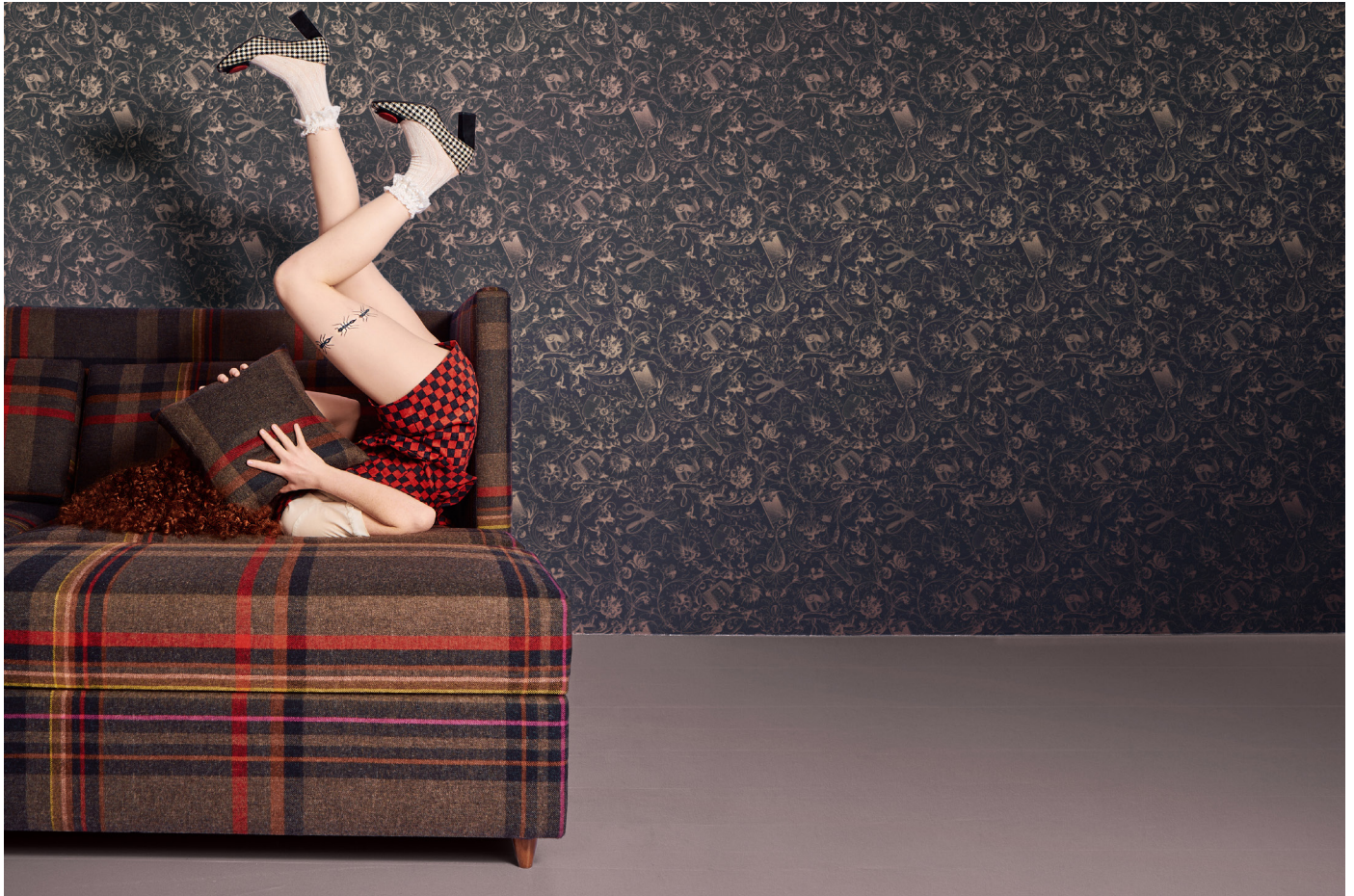
Furniture and styling HiLo Brooklyn