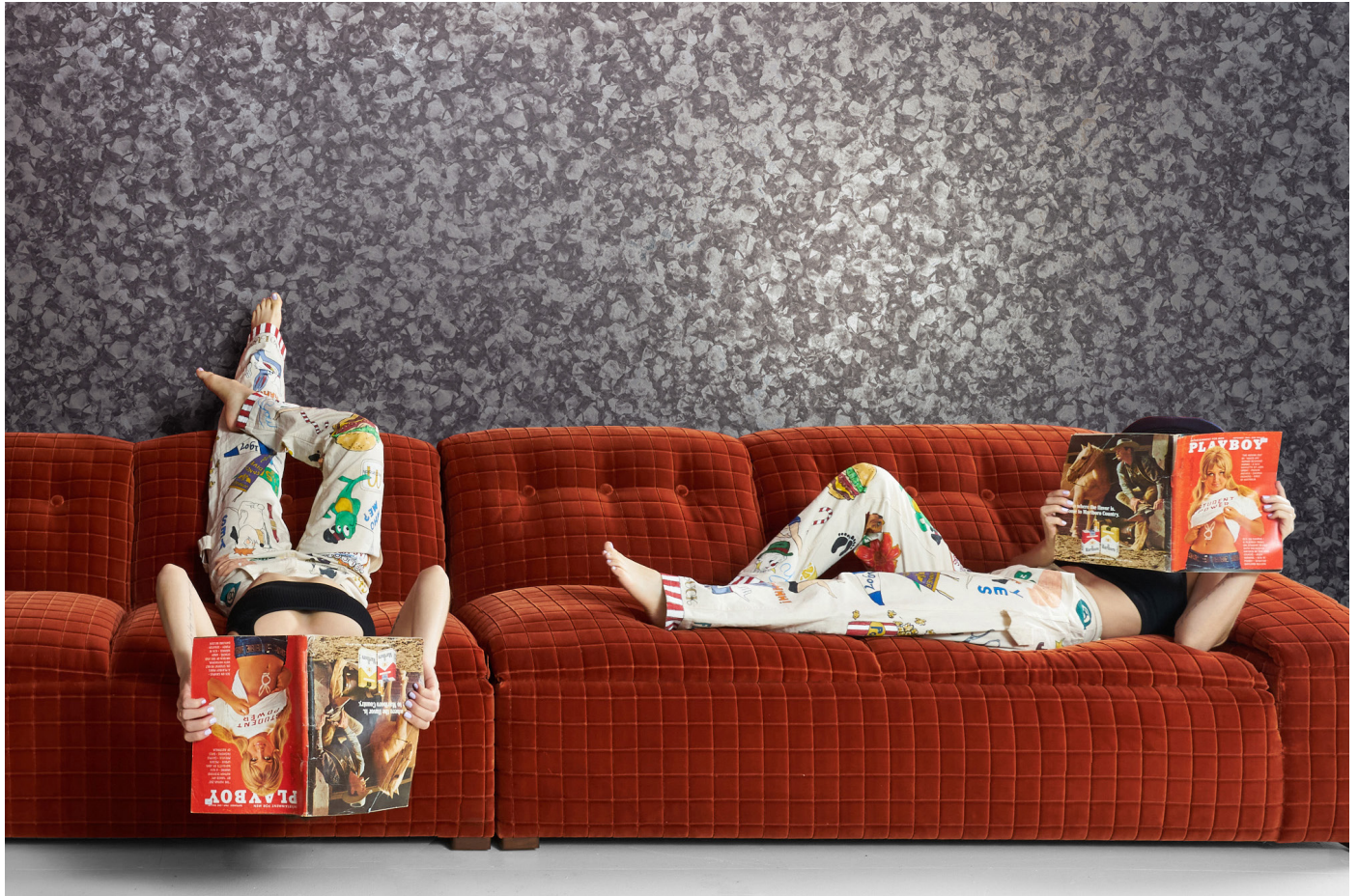
Furniture and styling HiLo Brooklyn, Photography Chaunte Vaughn

Artists Jon Sherman and Boone Speed found a gorgeous Brazilian amethyst quartz specimen at the Gem Show in Arizona, where they were searching for wallpaper concepts. They photographed the naturally formed prismatic gemstones and then digitally layered the images to create Of Quartz It Is. This wallpaper will fill your space with its grounding presence and sense of serenity, which is simultaneously powerful and comforting.