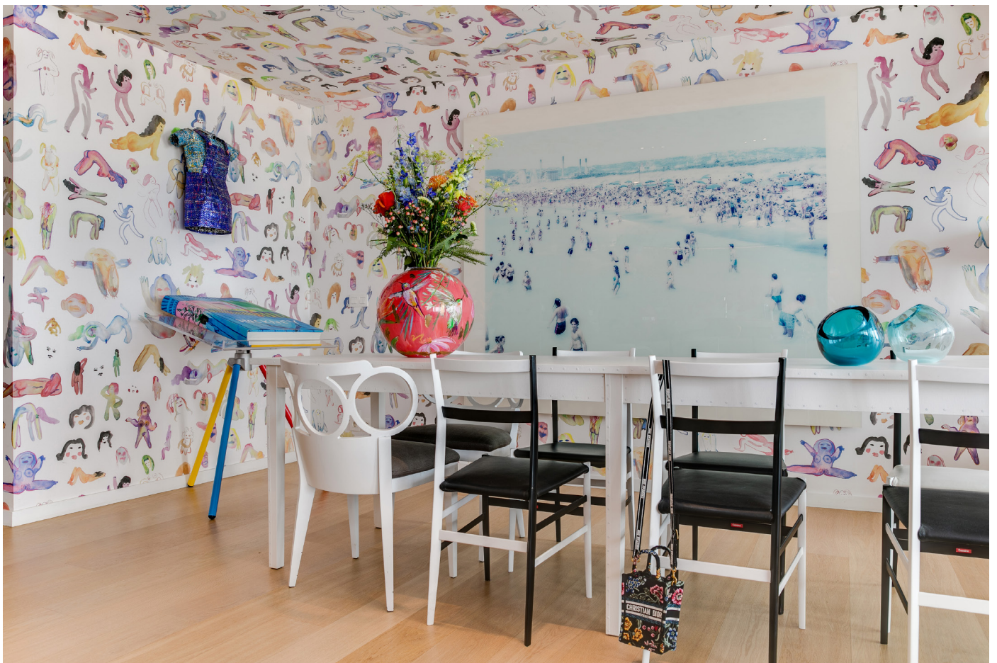
Interior Design by Animalick Designs