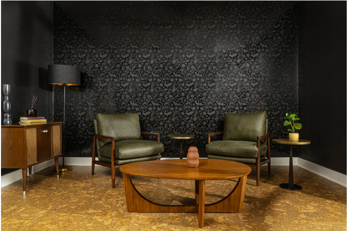
Interior Design by Upland Creative

Elysian Fields is an ornate floral design that utilizes carnivorous plants and bats instead of the usual roses and robins. We love the irreverence of these unexpected elements within the classic stylings of the pattern work.