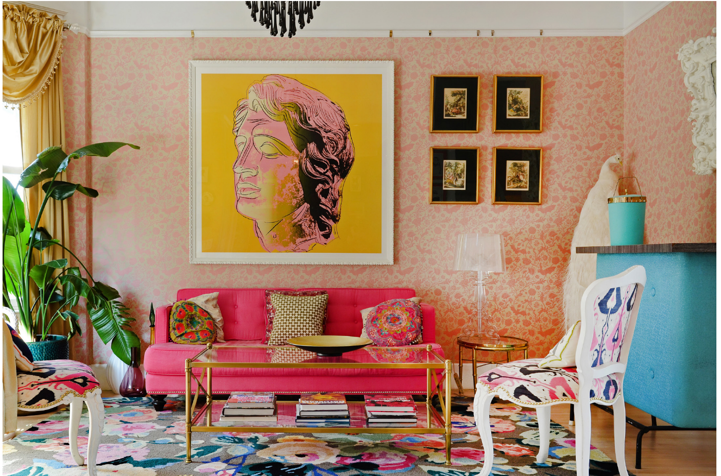
Interior Design by Allison Muir Design

Elysian Fields is an ornate floral design that utilizes carnivorous plants and bats instead of the usual roses and robins. We love the irreverence of these unexpected elements within the classic stylings of the pattern work.