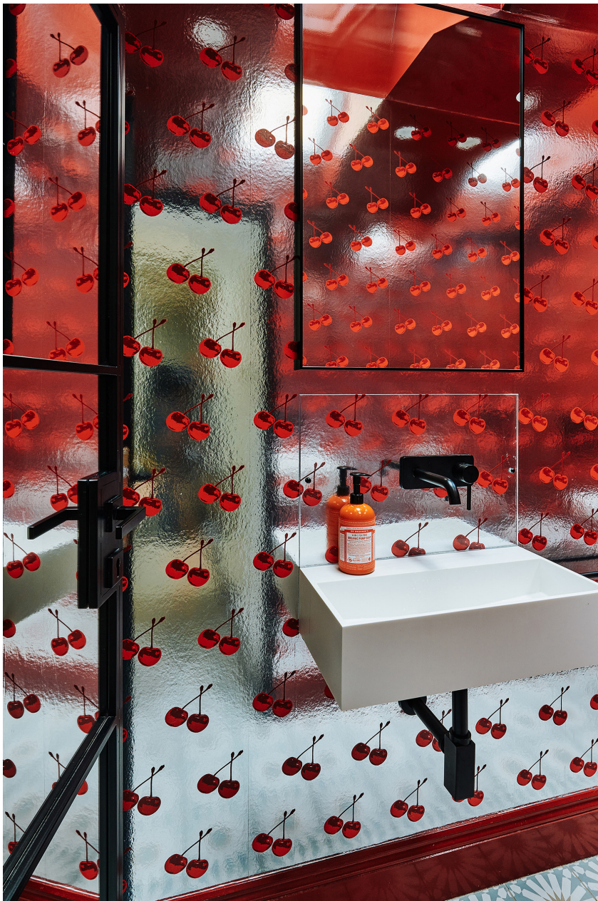
Interior Design by Atelier NM Interiors