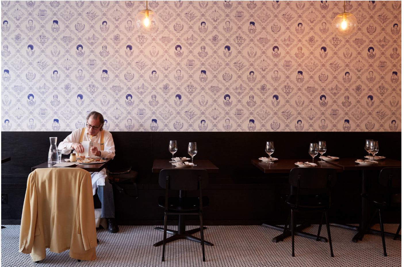
San Francisco's Fiorella restaurant