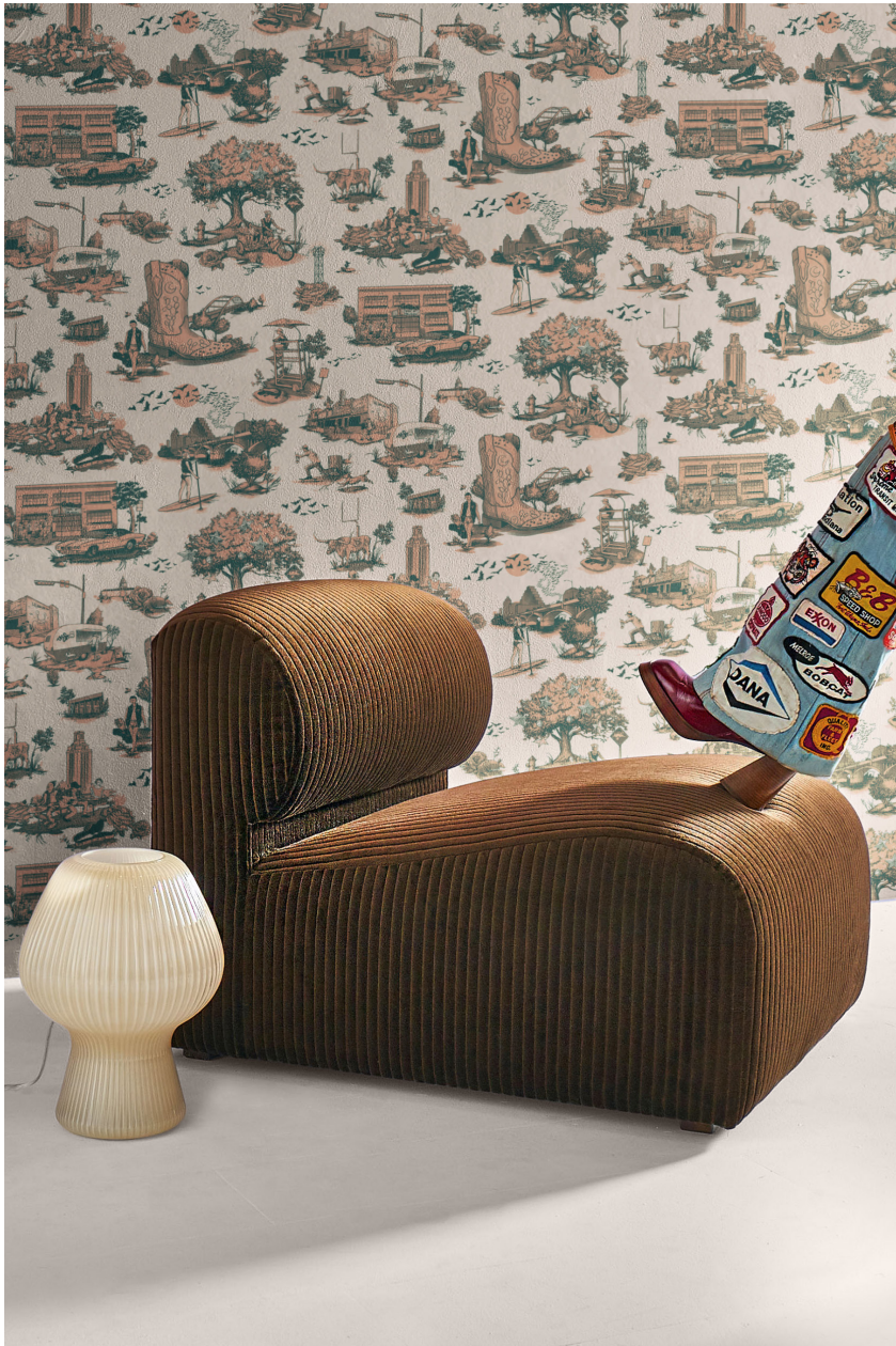
Furniture and styling HiLo Brooklyn