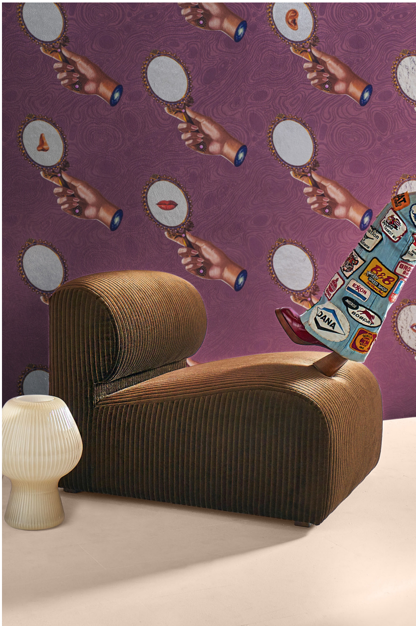
Furniture and styling HiLo Brooklyn

About Face examines femininity, beauty, and objectification by focusing on a woman's hand holding chrome Mylar mirrors, which reflect the viewer, set against a rich, shimmering burgundy wine marbled background. Isolated facial features appear occasionally, reminding the observer of how we focus on certain aspects of ourselves rather than the whole being.