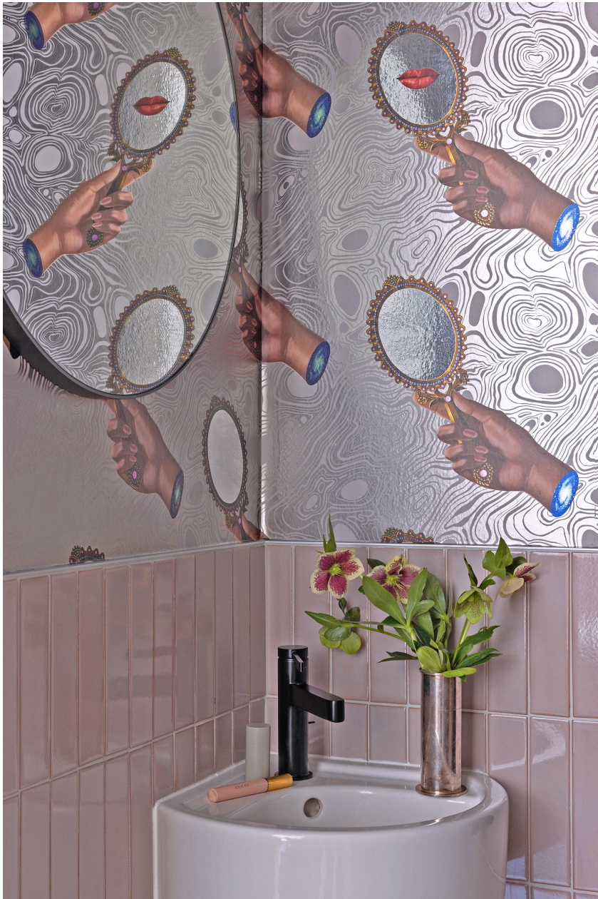
Interior Design by Amy-Pigliacampo Interiors, Photo by Corey Szopinski

About Face examines femininity, beauty, and objectification by focusing on a woman's hand holding chrome Mylar mirrors, which reflect the viewer, set against a soft, shimmering mauve marbled background. Isolated facial features appear occasionally, reminding the observer of how we focus on certain aspects of ourselves rather than the whole being.